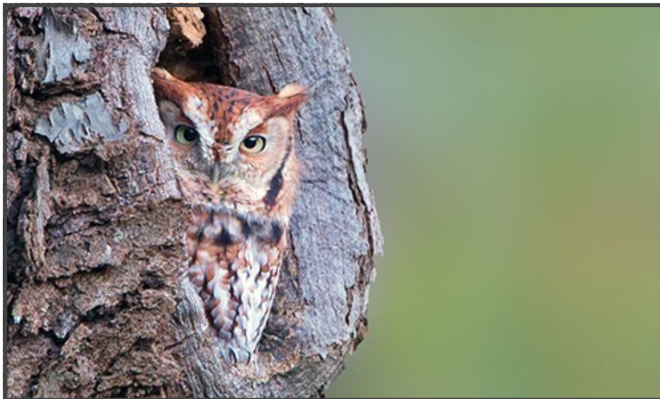
The Eastern Screech owl sitting in a tree.

The Eastern Screech Owl is a small fluffy brown owl. This owl is usually around 8.5 inches long, and their wingspan is about 21 inches long. They have big yellow eyes, and small ear tufts. They are of least concern in the endangered list, and in fact are increasing. Unlike many owls, the Eastern Screech Owl has the most varied diet. According to AnimalsSpot.net they will eat anything that swims, flies, wriggles, or runs. They live on the east and middle side of North America. They usually nest in tree holes, woodpecker holes, and even human made bird houses. The Eastern Screech Owls lifespan is around 14 years in the wild, and 20 years in captivity. So, this is a little bit of information on the Eastern Screech owl. An amazing species of owls to have on this planet.