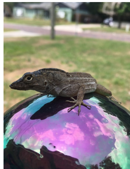
This adorable lizard belongz to Kai Kidd