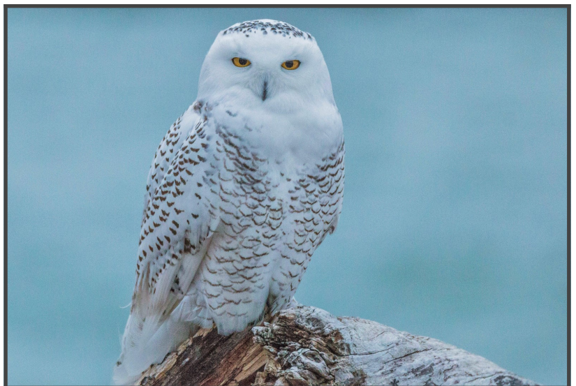
A Snowy owl sitting on a tree.

Unlike other birds, these owls don't always migrate. Sometimes they will stay at their nest all year round, and sometimes they migrate. When they do decide to migrate they usually go to Canada, the northern United States, Europe, and Asia.