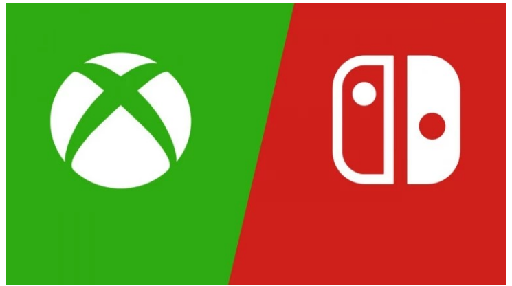
Microsoft and Nintendo are two of the video game companies benefiting from this pandemic.

While this pandemic has created confusion and uncertainty for many, the entertainment industry has found a way to cope with this by utilizing the power of technology.