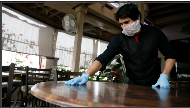
Employee disinfecting a table to ensure it is clean.

LOCAL - Thousands of restaurants across Florida have been forced to shut down because of COVID-19. Paranoia is in the air, and especially when it involves food. Restaurants are taking extra precautions to keep their customers and employees safe. Cleaning, cutting down on capacity, and social distancing are a few ways that these restaurants are making it by. According to Chron and cnet, many though, aren't doing so well. Along with all these precautions, there is also a food shortage. Pasta, canned soup and foods, pasta, meat, and rice are all in high demand due to the virus. This shortage causes many restaurants to suffer, because without food, the restaurants cannot support themselves.